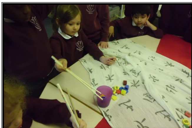
We practised using chopsticks!