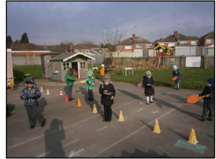
Running a Pancake Race

After the holiday we will be doing activities about who looks after us ready for Mothers day.