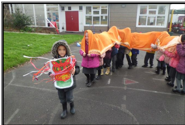
We danced like a dragon!