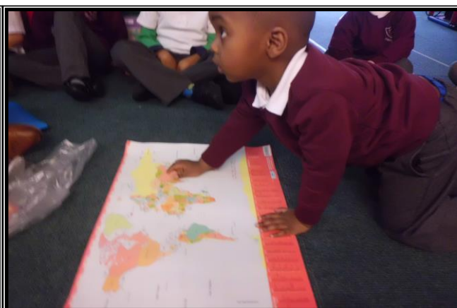
We found out where China is on the map.