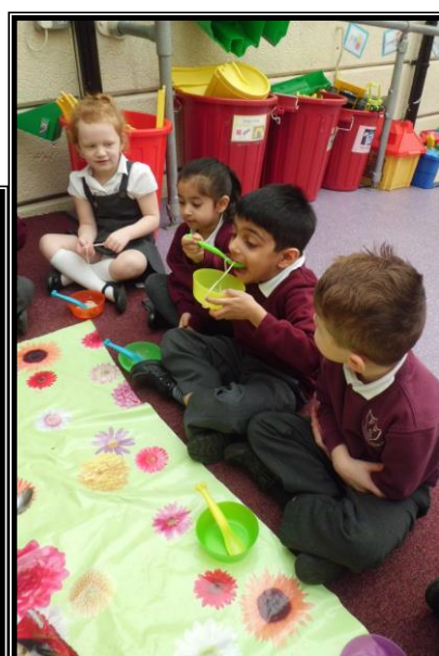
We tasted Chinese food!