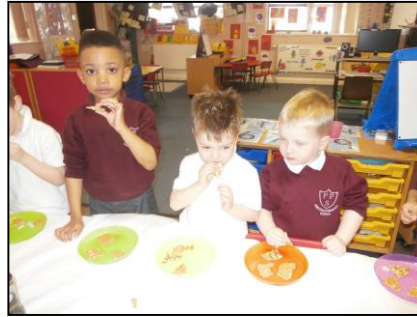
Tasting Pancake Toppings